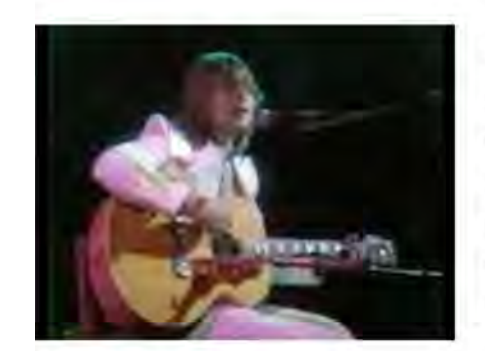
Video: Lucky Man

The autobiographical concert is a narrative of Lake's experiences from childhood to the present, including never before revealed details, funny and poignant moments, and colorful facts of his extraordinary career as one of the world's leading and influential musicians, songwriters, vocalists