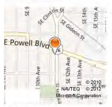
Location: Aladdin Theater